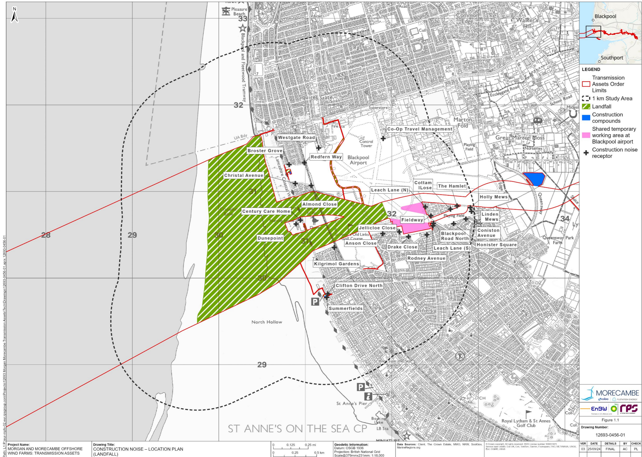
Figure 1.1: Construction Noise Location Plan (Landfall)